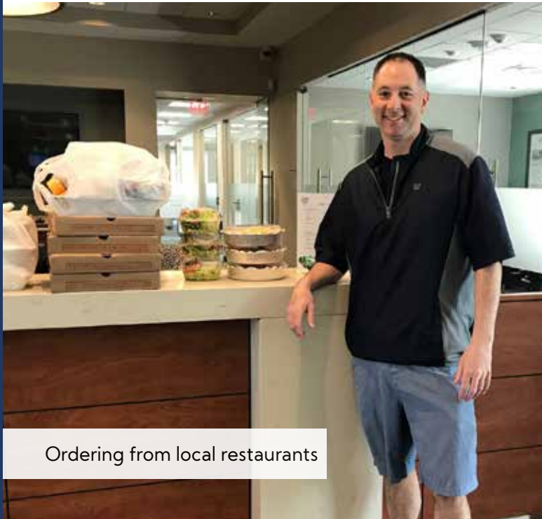
Ordering from local restaurants