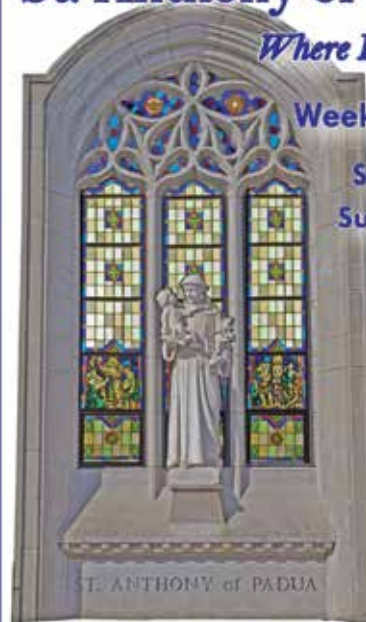
ST. ANTHONY of PADUA