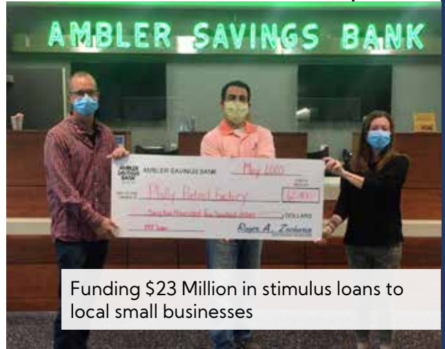
Funding $23 Million in stimulus loans to local small businesses