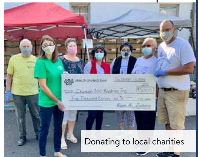
Donating to local charities